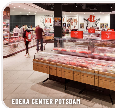
EDEKA CENTER POTSDAM

** The energy class information given here refers to remote standard models and exact product configurations and equipment. Other configurations may result in lead to a significant change in the energy class information.