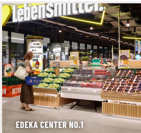
EDEKA CENTER NO.1